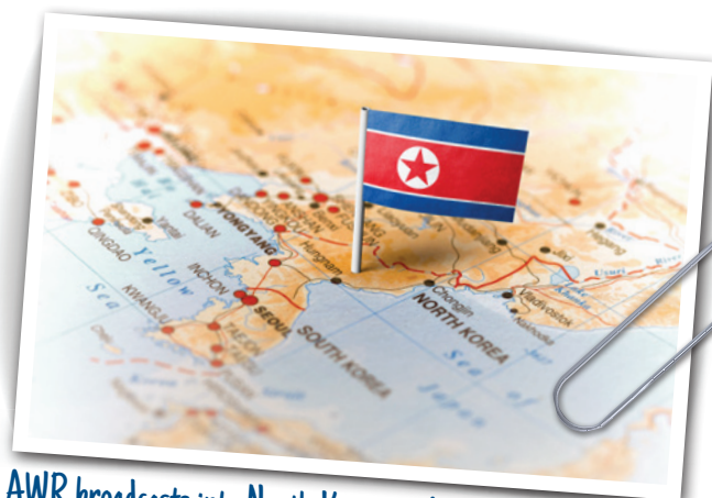
AWR broadcasts into North Korea on AM radio will provide listeners with unrestricted access to messages of hope.