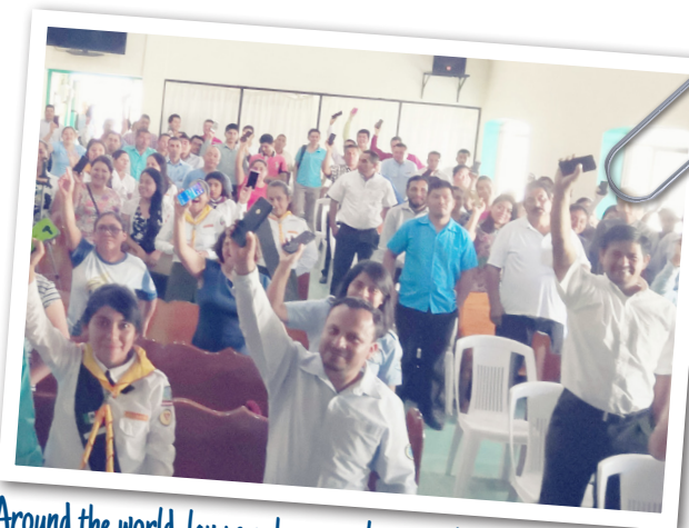
Around the world, lay members are learning how to use their cell phones as evangelistic tools to reach their friends and neighbors.

If we have learned anything as we watch this phenomenon mushroom into a gigantic worldwide ongoing evangelistic series, it's that the work is not ours, but God's. He is taking what we do and running with it. We just need to keep doing what we're doing—sharing this wonderful message—and God's Spirit does the rest!