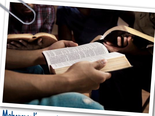
Mohammed's parents were secretly meeting with a large group of people to study the Bible.