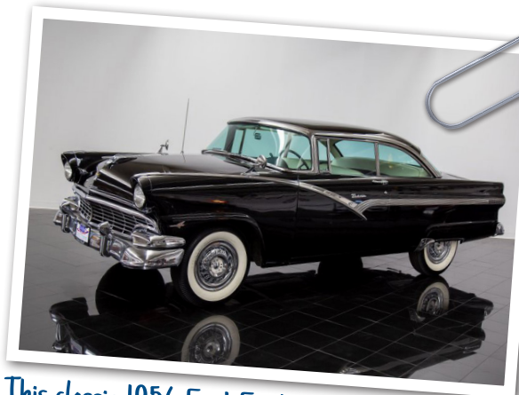
This classic 1956 Ford Fairlane looks just like mine did back when I was 16 years old.

I never forgot that experience, and I felt my mother's prayers many times in my life. But mothers aren't the only ones who pray. Fathers pray as well. Let me share a very special story that you know in part, but this week we received a moving update.