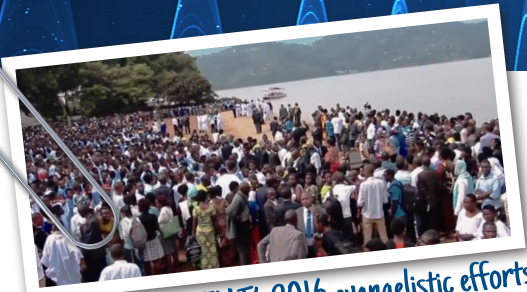
During AWR/TMI's 2016 evangelistic efforts in Rwanda, more than 100,000 were baptized.

This had never been done before, and I must confess I entertained some doubts. We would do our part and preach, but to expect so many baptisms from an evangelistic series was unrealistic!