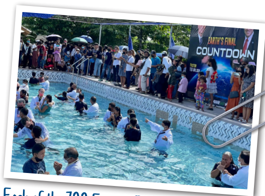
Each of the 700 Former Rebels who were baptized committed to reaching another soul for Jesus.

We are now working with them so that each Former Rebel village will soon have a church building where they can gather and worship together. As I mentioned in a prior letter, the cost per building is $5,000, and many of you have joined us in providing funding. I can’t wait to share with you the pictures of these precious FRs—Fully Reconciled men and women worshipping together in their new church buildings! Please keep this project in your prayers.