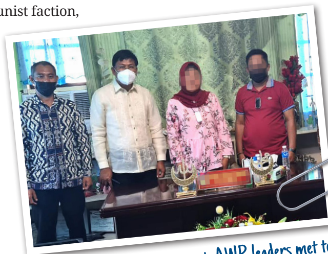
At the Muslim mayor's request, AWR leaders met to discuss bringing Adventist World Radio to her city.

Then a Muslim mayor requested that AWR start airing in her city. “We will fully support you, because Seventh-day Adventists are welcome in our city.”