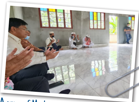
A group of Muslim imams meet with AWR and Adventist Church leaders to pray together in a gesture of solidarity.

P.S. We can only stand amazed as we witness what God is doing around the world. We realize it is God’s Spirit who is convicting hearts. Our part is to faithfully share the message, and the rest is up to God! Thank you for joining us in this incredible adventure of faith. What a privilege and what a blessing!