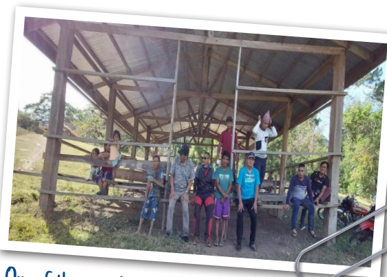
One of the new churches being built for the Former Rebels in Mindoro.

As I write this letter, we’re preparing to travel back to the island of Mindoro to witness the baptism of 700 new souls who have made a decision for Jesus through the witness of the Former Rebels baptized last November. I shared with you how they had pledged to “each one win one,” and they fulfilled that promise! They, too, are new disciples born into the kingdom as missionaries. Their enthusiasm is contagious, and I look forward to sharing with you the latest miracles of lives changed! Plus, I’ll have an update on the many new church buildings being raised in the different villages. Watch for this update next month.