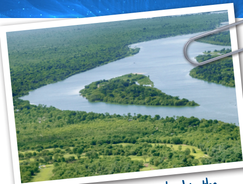
God's love can even reach an island in the middle of the Zambezi River.