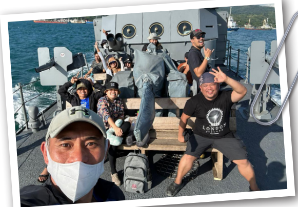
Our AWR SULADS medical team is heading to Jolo, Sulu, Mindanao, for medical outreach and evangelism. We are assisted by the Philippine Navy to reach this Muslim area for Jesus.

This past weekend, part of our AWR team traveled to Mindanao with a group of SULADS missionary students from Mountain View College in the Philippines to set up a free medical clinic among the rebels. We have partnered with them on this project. They have experience reaching Muslims in the mountain areas, and we equipped them with projectors and materials. A group of military personnel went with us not only for protection, but also to help. They, too, are being transformed by the power of God!