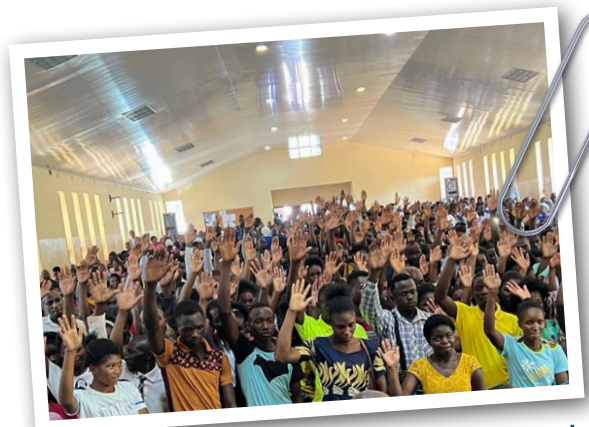
Baptismal candidates in Livingstone raising their hands in commitment.

That's why, when these 22 girls came to me and said, "Pastor, what will happen to us?" I said, "Nothing will happen to you. By God's grace, we're going to help you, and we'll work out a plan with the local church."