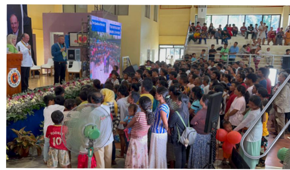
Large groups enthusiastically responded to each altar call.