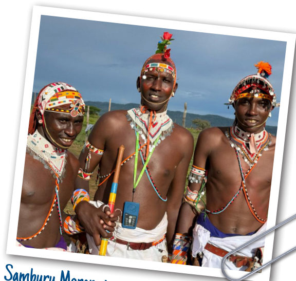
Samburu Moran warriors are carrying Godpods around their necks and listening to God's Word.

As they arrived Sabbath morning at church, the warriors shared that they had listened to the Holy Bible all night. Proudly still wearing the Godpods around their necks, these Morans declared, "Now we know you are telling us the truth!" These warriors are being tamed by the love of God through the power of the Holy Word.